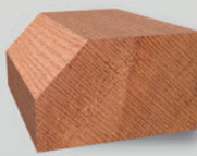
• 1/2" Chamfer

CUSTOM SIZES AND SPECIFICATIONS AVAILABLE BY REQUEST