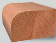
• 1/2" Roundover